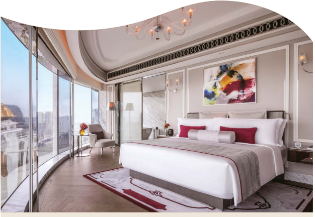
Suite of Raffles at Galaxy Macau